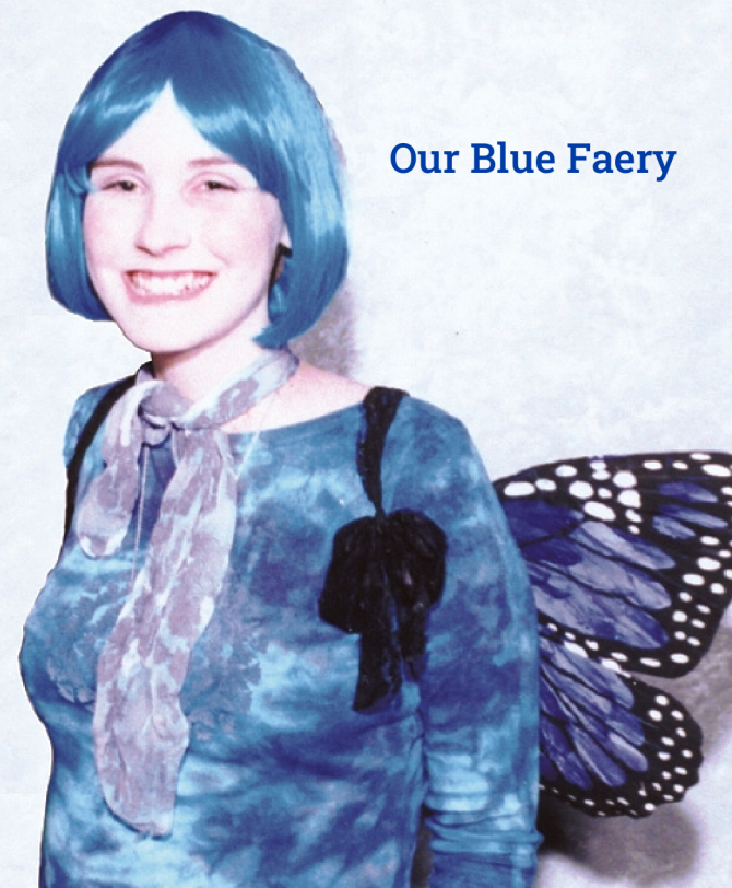
Our Blue Faery